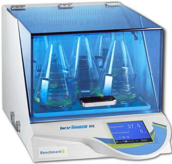
Incu-Shaker 10L (H2010)